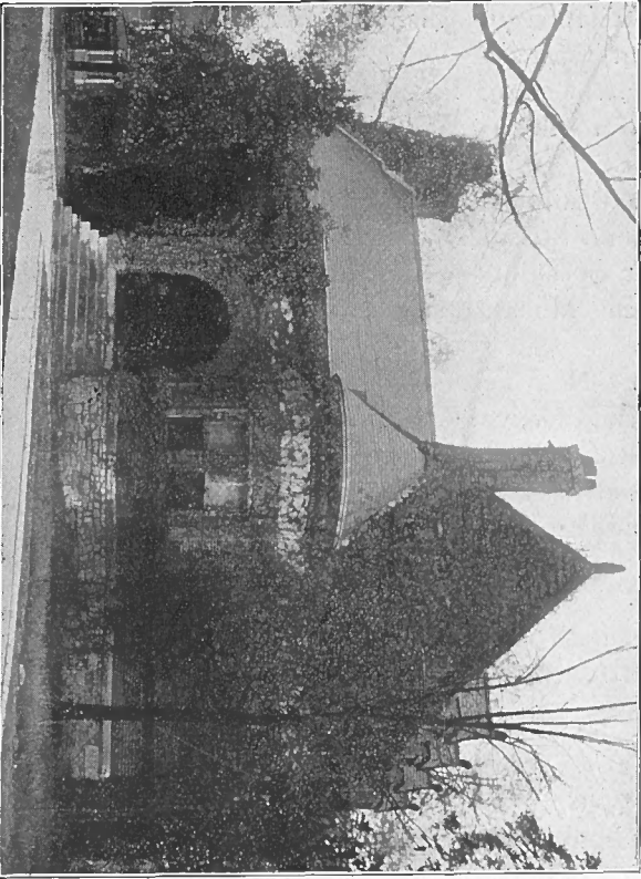
THE LIBRARY BUILDING.