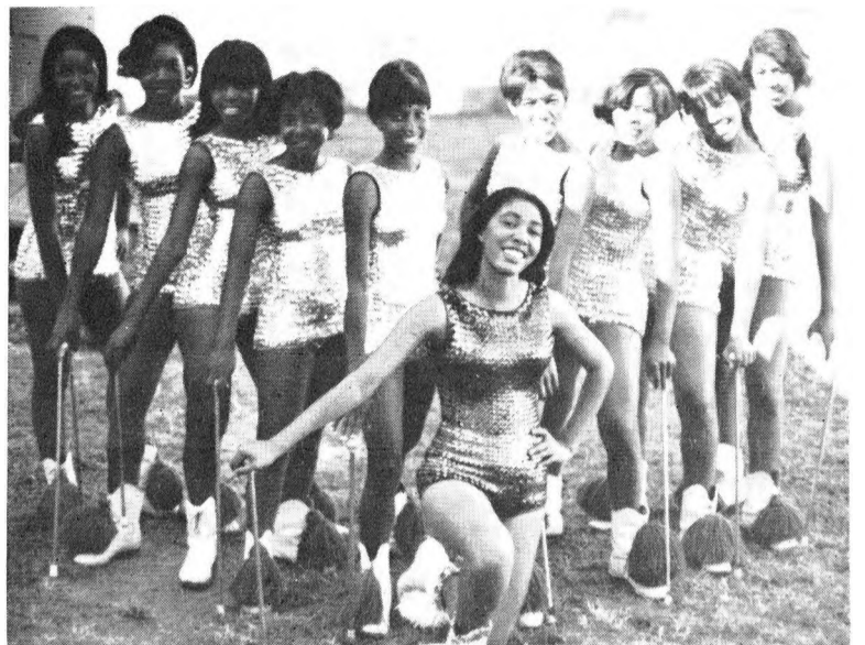
No show is complete without that feminine touch. Here are our ten lovely majorettes.

The Macy's parade is one of the largest parades in the country, second only to the Rose Bowl Parade, in which the Marching Wolverines are hopeful of being a part in the near future. The parade will be two miles long and will be viewed by millions of people. It will be telecast from coast to coast on