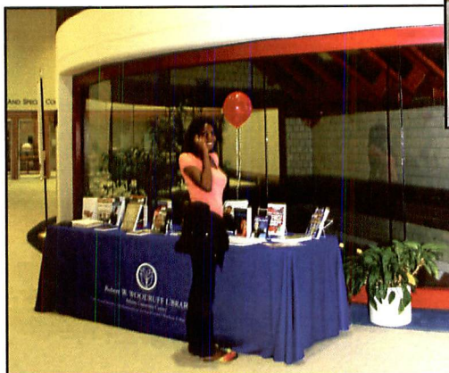
An AUC student checks out the election and voting resource display table during "Election Watch Night @ the Library."

RWWL also sponsored election and voting-related