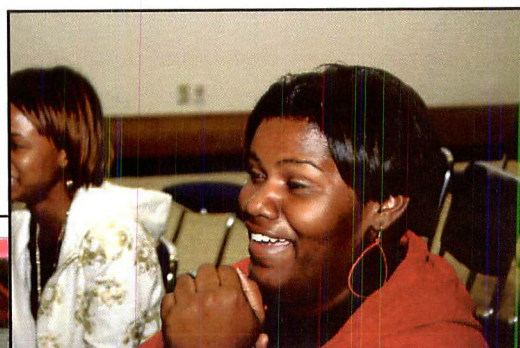
AUC students express excitement when Sen. Barack Obama's victory becomes official.

Right to Vote," chronicling African Americans' struggles to obtain and exercise their voting rights