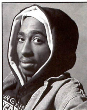
Tupac Shakur

"Mr. Shakur was a multi-dimensional artist, who helped define a musical genre, and as the