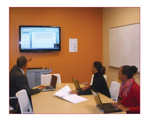
Brainstorming and group work is made easy with TeamSpot.

a central main screen located on the study room's wall. Each collaborator can then instantly and simultaneously make changes to a single document that can be seen on the central screen. Documents such as images, PDFs, and spreadsheets can also be sent from one's personal laptop to the laptops of other group members. In addition, TeamSpot users can also surf the Web and share websites on the central screen. For more information or to reserve a TeamSpot study room, stop by the Information Services Center.