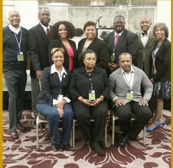
Past and current presidents of the National Conference of Black Political Scientists at Deed of Gift Signing, NCOBPS Annual Meeting, Atlanta, GA, March 2015, AUC Woodruff Library

variety of topics including black politics in relation to President Ronald Reagan, as well as the economy. The Collection highlights the changing approaches to black politics that African Americans have taken since the founding of NCOBPS.