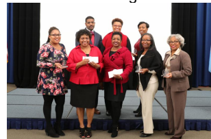
Finance & Human Resources Depts.