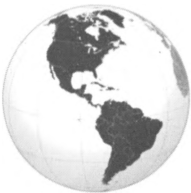
THE AMERICAS: UNITED STATES