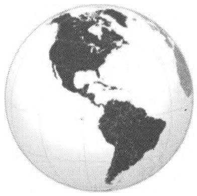
THE AMERICAS: UNITED STATES